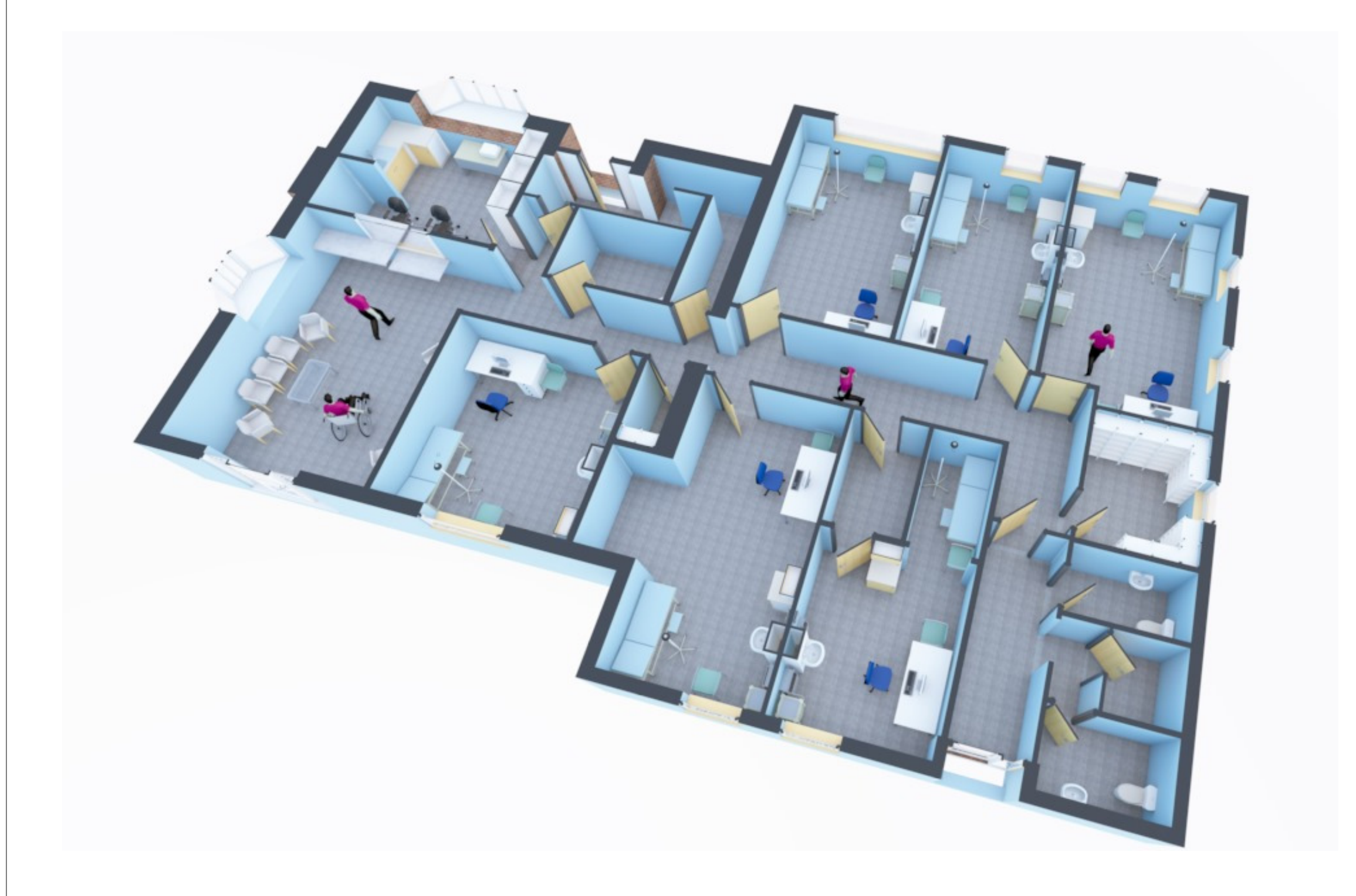
PROPOSED CUTAWAY PERSPECTIVE 1